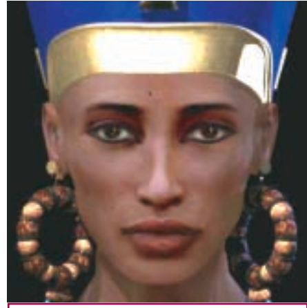
The face that could belong to the legendary Egyptian Queen, Nefertiti. An artist's impression based on Schofield and Evison's facial reconstruction.

'Judgement of ancestry can be difficult as skull features common in Africans can be found in Europeans, and vice versa'